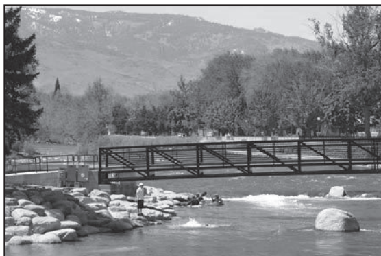
The Truckee River, Reno, NV