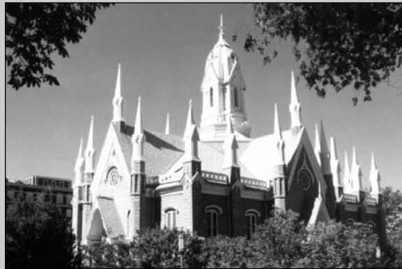
The Mormon Temple's Assembly Hall is just one of many of Salt Lake City's scenic attractions.

Utah Transit Authority: UTA operates both the area bus system and TRAX, the city's light-rail system. Most visitors will find TRAX more useful than the buses. The north-south TRAX