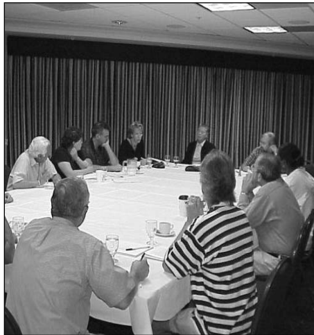
The WSSA leadership brainstorms during one of their fall meetings.

As immediate Past-President of WSSA, I serve as chair of a Nominating Committee for next year's election of