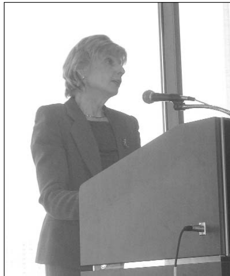
Author Eleanor Clift delivers her plenary address at Las Vegas last spring.